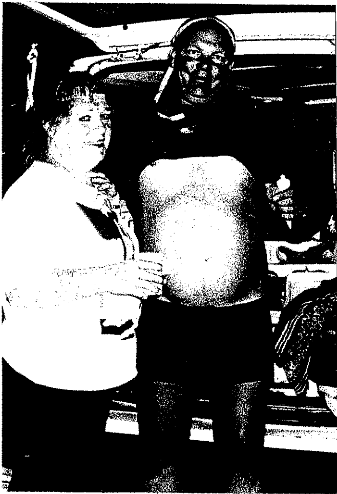
I'm FULL - See